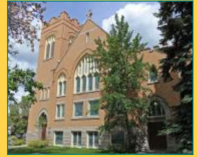
First Presbyterian Church