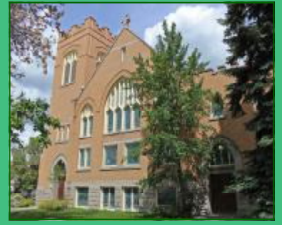
First Presbyterian Church