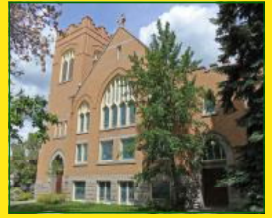
First Presbyterian Church