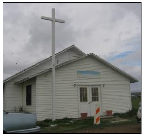
Red Eagle Memorial Church, Ft. Kipp, Montana

For a third year in a row, we are planning to travel to the northeastern corner of our state to be with brothers and sisters in Christ on the Ft. Peck Reservation. Dakota Presbyterian Churches and First Presbyterian Church of Poplar have welcomed our group with warm hospitality and eagerness to share their lives and culture. This year, we have been asked to map and document the cemetery associated with the Red Eagle Memorial Church at Ft. Kipp. In addition, we will complete some "fix-up" projects and spring yard work around the church. The cemetery work is indisputably "Holy Ground" work. Receiving hospitality helps us recognize Christ in our midst.