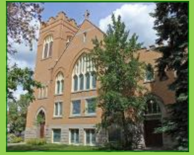
First Presbyterian Church