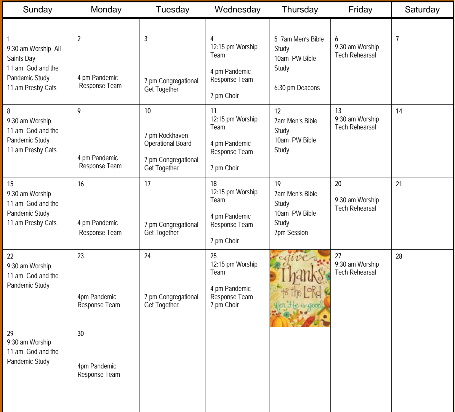
First Presbyterian Church

In these changing times the events on the calendar have changed too. Until further notice all the services, group meetings and events will be by Zoom until we find it safe to come back together. Please contact the leaders of the group meetings for instructions on how to get on Zoom for the meetings. We will update this calendar each week in the PresbEnews and on the church website as more meetings and events are scheduled. Stay Healthy.