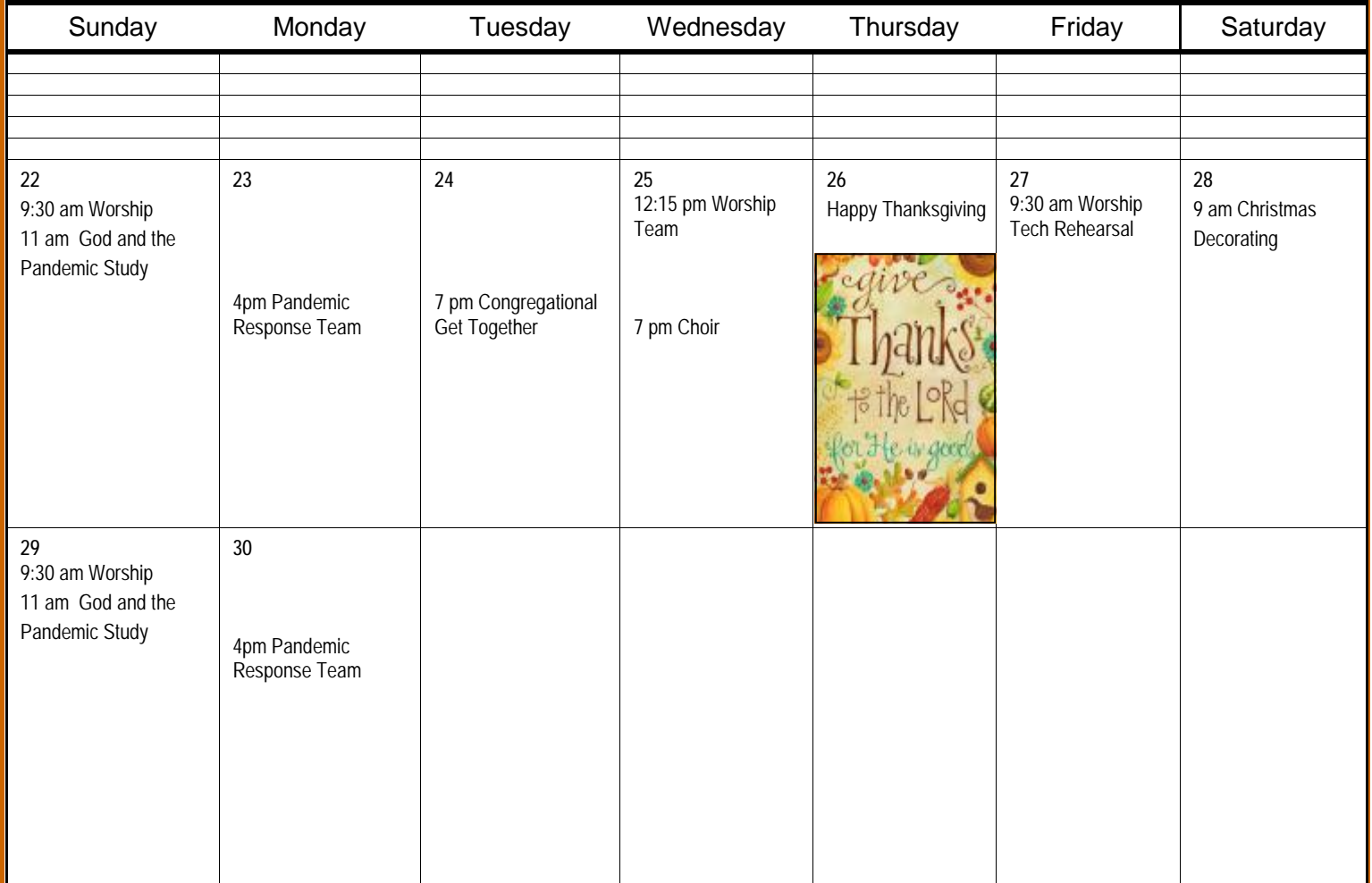
First Presbyterian Church

In these changing times the events on the calendar have changed too. Until further notice all the services, group meetings and events will be by Zoom until we find it safe to come back together. Please contact the leaders of the group meetings for instructions on how to get on Zoom for the meetings. We will update this calendar each week in the PresbEnews and on the church website as more meetings and events are scheduled. Stay Healthy.