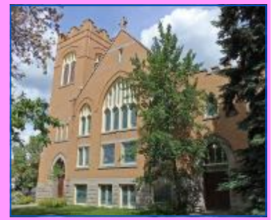
First Presbyterian Church