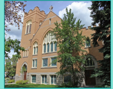
First Presbyterian Church