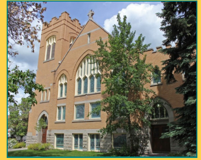
First Presbyterian Church